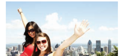
Friendly and inviting, that's Canada.

Canada — One of the world's most welcoming nations, Canada is home to thriving populations of many nationalities. Known for its quality education, healthcare and social services, Canada is consistently ranked as one of the best places in the world to live.