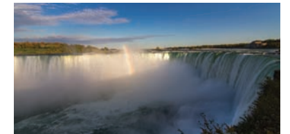
Niagara Falls, Ontario.

Southern Ontario — Hamilton sits in heart of Southern Ontario, midway between Toronto and Niagara Falls. Explore peaceful lakes, bustling urban centres, world-class sports, theatre, and dance performances, and the delights of hundreds of international cuisines.