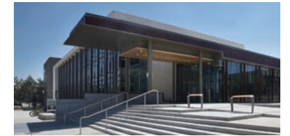
Mohawk College's Fennel Campus.

Mohawk Campuses — With modern facilities on three campuses, Mohawk has invested in spaces for students to enjoy. Attend lectures in technology-enabled classrooms, develop skills in industry-simulated settings, and make friends at the new International Language & Culture Centre.