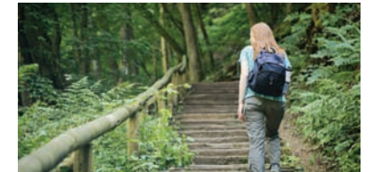
Hiking on the Bruce Trail.

Hamilton — On the shores of Lake Ontario, the city of Hamilton is a destination for shopping, dining, music, art, and recreation. Breathtaking views on the trails of the Niagara Escarpment attract birders, hikers, cyclists, rock and ice climbers. Find out more about Hamilton at hamiltontourism.ca