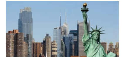
It's a short flight to New York City.

United States — Canada borders the United States in North America, locating us just an hour's flight away from great American cities like Chicago, Boston, New York and Washington DC.